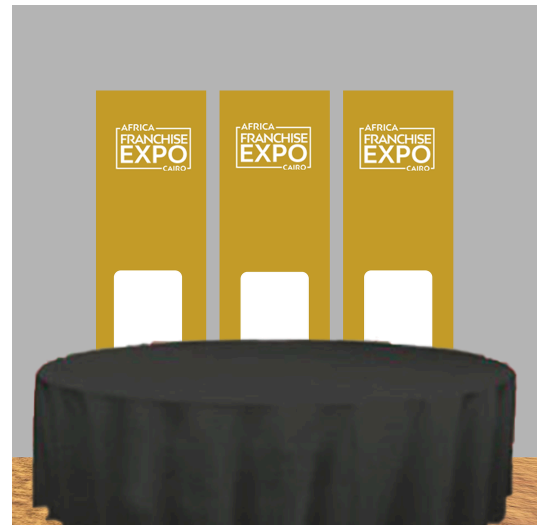
VIP SPACE WITH 4 CHAIRS & 1 ROUND TABLE